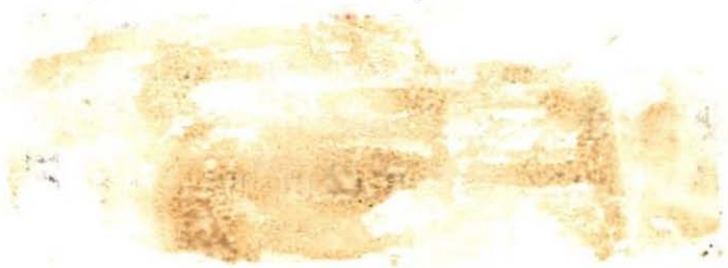
Fig. 1: Stage 1 Ankle.