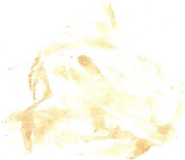
Fig. 2: Stages 1-3